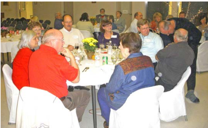
Knights and their wives enjoyed elegant table settings, great food and warm fellowship.