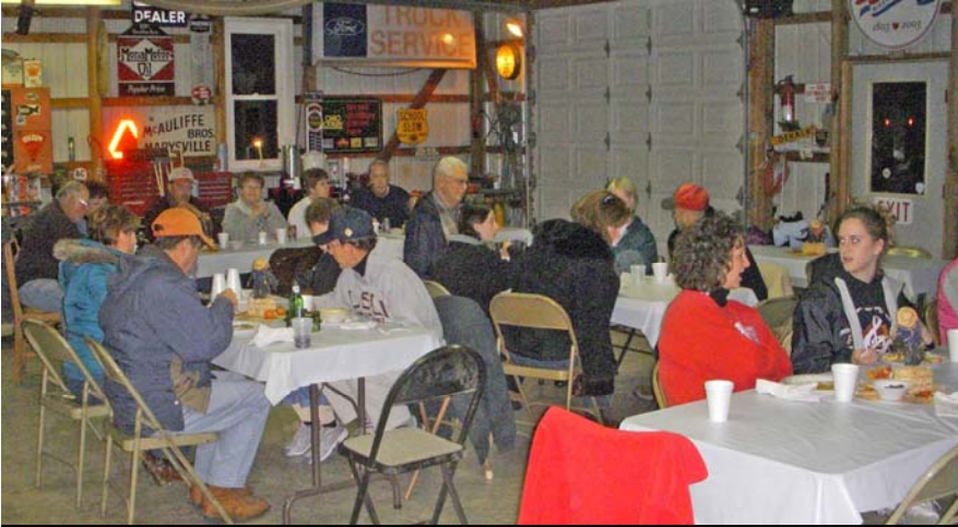
Members gathered in the barn to enjoy a food spread of dips and snacks, sloppy Joes, hot dogs, salads and desserts, along with a variety of beverages.

Some 30 adults and children gathered on a cool Autumn evening and enjoyed great food, mulled cider and hot chocolate, a rambling hayride through woods and over meadows (complete with scary live "ghosts" in the darkness), and a time of reflection and fellowship around a roaring campfire.