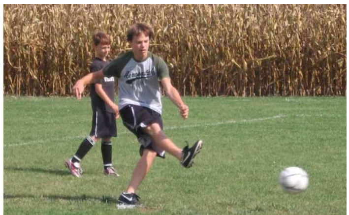
Another contestant aims his kick at the goal.