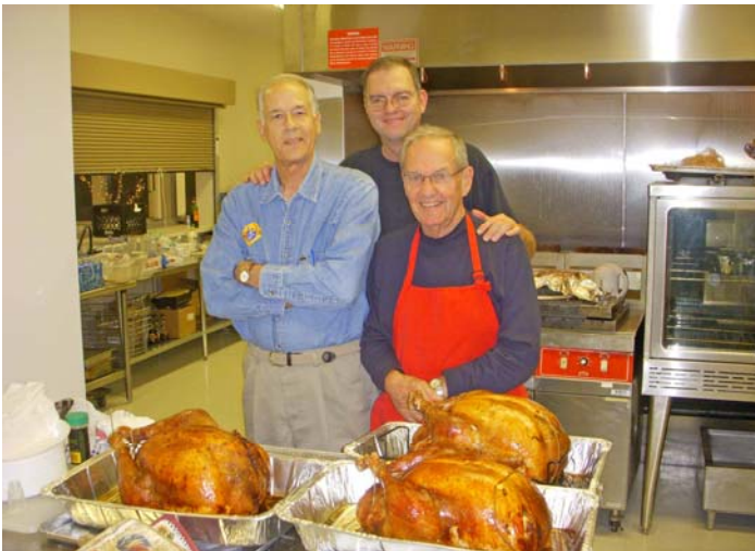
Three chefs and three 20-pound turkeys. Ladies were not permitted in the kitchen.

The live entertainment hour featured selections by the Southern Gospel Singers.