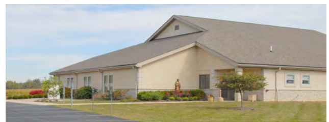
Parish Activity Center and Parish Office 670 W. Main St Plain City, OH 43064

CONFESSIONS: 3:30 pm Saturdays and by appointment